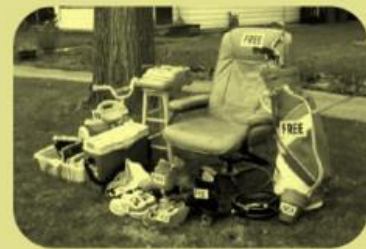
This event is not affiliated with any organization. Participation in this event is voluntary.